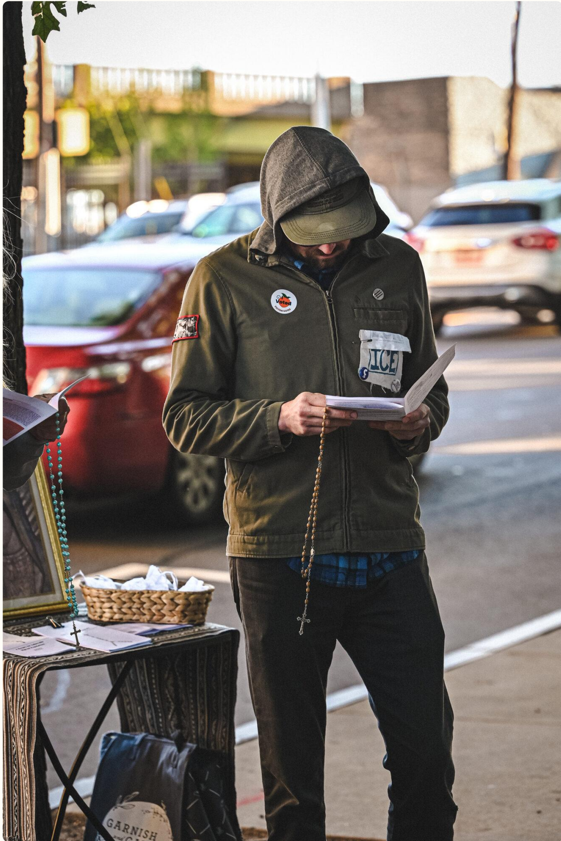
Community members gather in prayer every Friday morning outside Atlanta ICE Field Office. In this space, faith and presence become acts of advocacy.